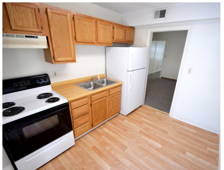
Larger photos represent the one-bedroom