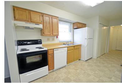
Thumbnails represent the three-bedroom